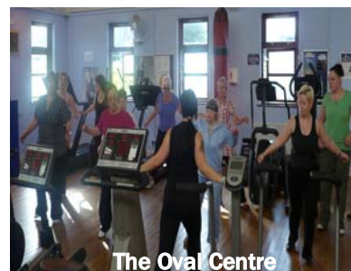
The Oval Centre

The aim is to maximise the potential of the three gyms and help the local people help themselves. As a cluster